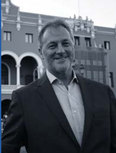
JORGE MUÑOZ Mayor of Lima

“The next time you come to visit, you will find a more inclusive and accessible Lima”